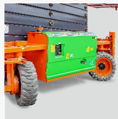
4WD&4WS (Apply to JCPT2223/JCPT2212)