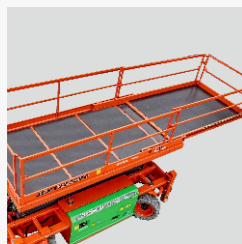
One-key Extended Platform (Apply to JCPT2223)

In addition to all the advantages of engine drive types, in view of the pure electric design, the electric drive rough-terrain scissor lift series also takes into account the environmental advantages of noiseless, zero emission and so on. It is suitable for the operation environment with high environmental requirements, such as SGCC, nuclear power plant, SINOPEC, CNPC, residential area, airport, tunnel, etc.