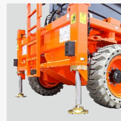
Automatic Leveling Outriggers